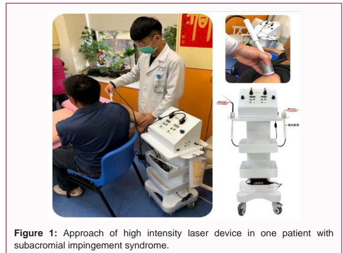
Figure 1: Approach of high intensity laser device in one patient with subacromial impingement syndrome.

Scores were recorded by making a handwritten mark on a 10-cm line representing a continuum from “no pain” (score of 0) to “worst pain” (score of 10). The far left end received a 0 score, indicating no pain, while the right end was a score of 10, representing severe