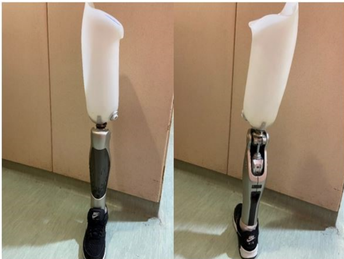
Figure 2: Front (left panel) and back side (right panel) of the C- Leg.