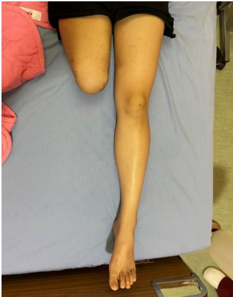
Figure 1: Lower legs of our case. Her right stump shows clean with well shrinkage (cone-shape) in the distal part of the stump.

This is a 26-year-old female without any systemic disease. She got injury running over by a car in a vehicle accident on 2020/11/29 while riding motorcycle. She was sent to emergency room of local hospital. Due to disastrous crush in her right lower limb, transfemoral above knee amputation was performed on 2020/11/29. Pelvic fixation was also done for pelvic fracture. After wound healed (Figure 1), she was transferred for rehabilitation training of right stump. She was discharged on 2020/12/26.